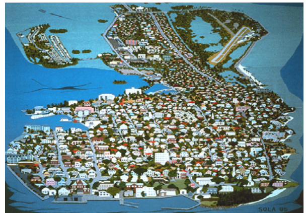
Key West 1985 10 ft x 7 ft wool, silk, cotton in the collection of the Key West Museum, Key West FL.