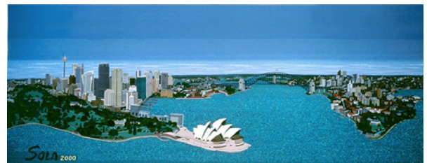
Sydney 2000 12 ft x 6 ft wool, silk, cotton in the collection of the Res Med Corporation, San Diego, CA.